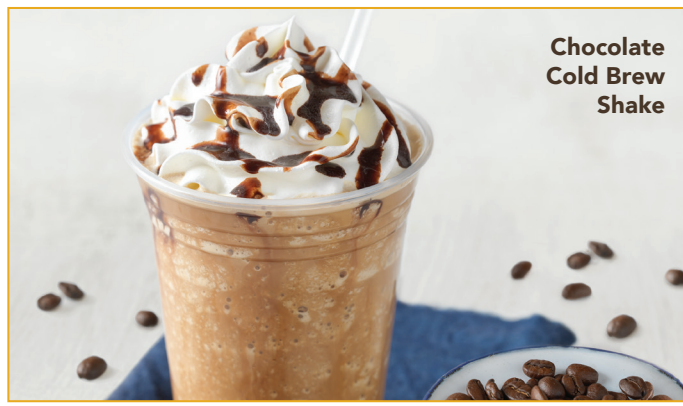
Chocolate Cold Brew Shake